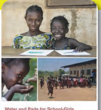
Water and Pads for School-Girls Wasser und Binden für Schülerinnen Empowerment fürs Leben!