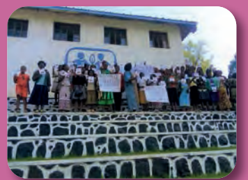
SOFEDEC at the primary school SOS Village Bukavu DR Congo